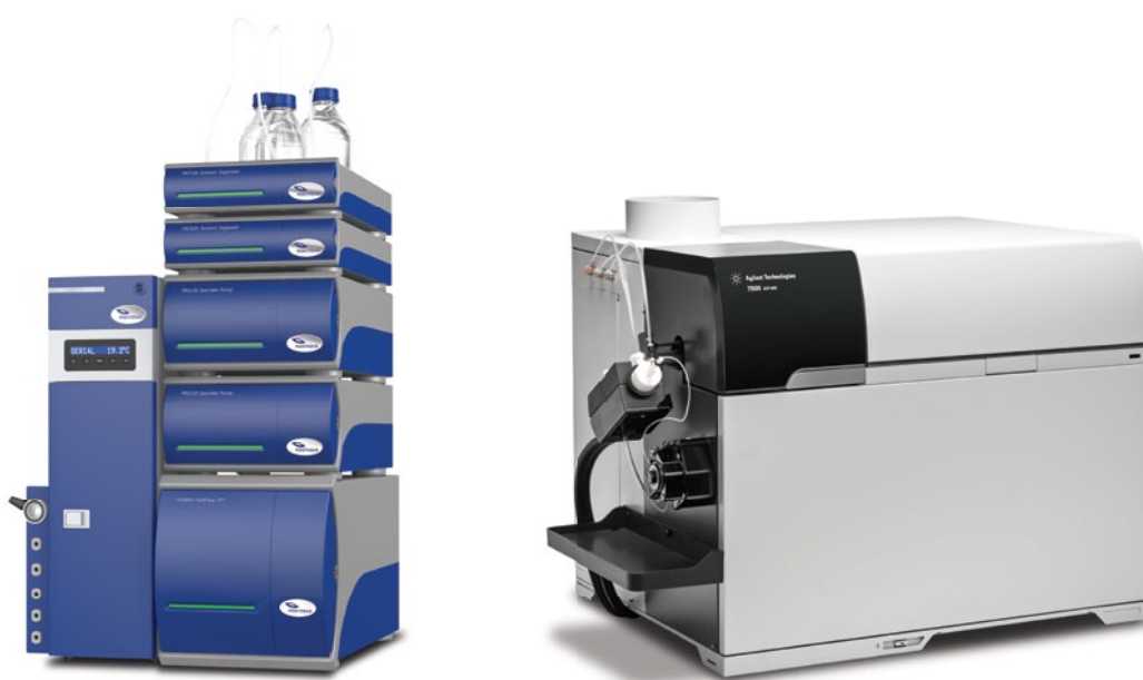
Figure 1: Postnova AF2000 MT and Agilent 7900 ICP-MS.

A sequence of 54 replicates with an analysis time of 30 sec was constructed for the spICP-MS analysis. The time delay between each consecutive replicate was 14 sec. The sequence was started upon injection of the mixture into the AF4 system. Each replicate was stored separately and analyzed for particle number and size using Agilent MassHunter Workstation software. The number of counted nanoparticles and average diameter of the replicates were compiled and graphed manually using Microsoft Excel and OriginPro.